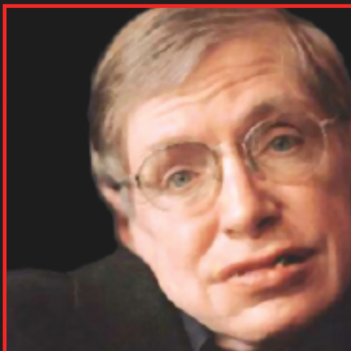
Professor Stephen Hawking supported the petition and signed up

LOUDER gives you a voice If you have something to say, a burning issue you think Parliament should be talking about, then get in touch with us today.... Here's how to contact us: